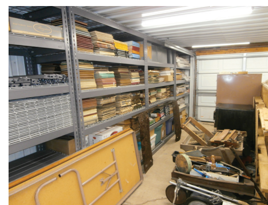
The Blackford County Historical Society has upgraded a storage garage that houses the many donations given to the Historical Society over the past forty years.