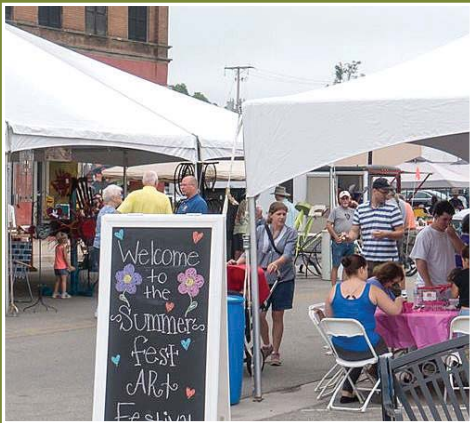
The SummerFest Arts Festival will be held again this year on the square in Hartford City thanks in part to a new Foundation grant.