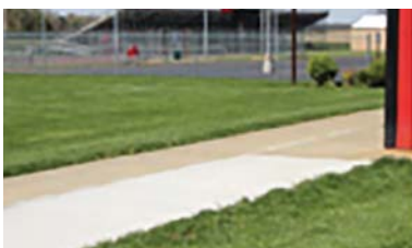
The sidewalk at the Blackford Youth Soccer Complex was widened and fencing replaced with funds from a 2015 Foundation grant.