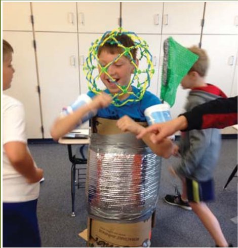
A new Camp Invention grant will pay part of the fees for about 45 students to attend a weeklong summer camp that encourages science and technology learning through hands-on experiences.