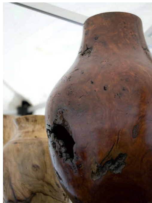
The Foundation partnered with several community organizations and governmental units to sponsor the first SummerFest in July 2013, a celebration of local art and artisans.