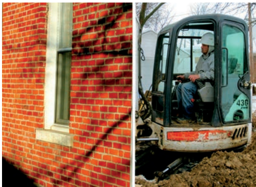
In 2013, the Blackford County Historical Society was awarded a Foundation grant to repair the buckling foundation of their building at 321 N. High Street in Hartford City. The project also included renovation of the exterior walls that needed shoring and tuck pointing.