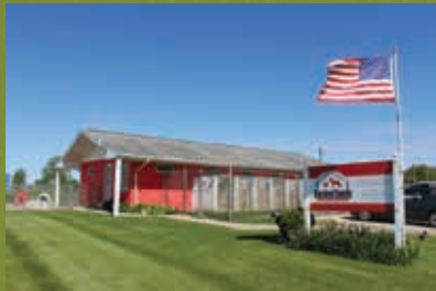
Blackford County Animal Shelter now has funds for expansion.