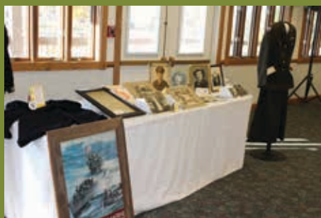
This display of local historic memorabilia was part of the luncheon program celebrating Indiana's Bicentennial.