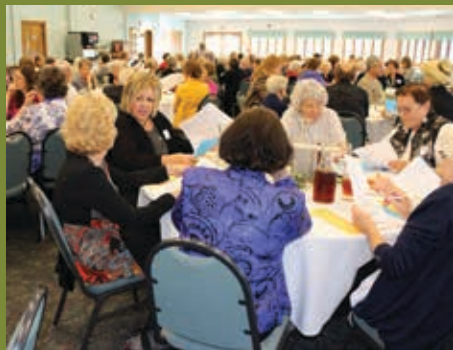
Members voted on 2017 grant awards.