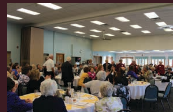
The residents featured in Speaking of Yesterday were honored at the W.O.W. fall luncheon.

The project was so interesting that W.O.W. is continuing to collect seniors' stories. To learn more about sharing your story, see the Foundation's website or contact the Foundation office.